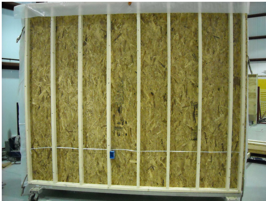
Figure 2: Second Wall Configuration

The second test wall configuration (prior to insulation and drywall) is shown in Figure 2.