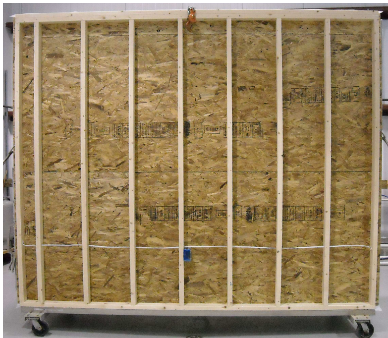
Figure 1: Test Wall Configuration

The first test wall configuration (prior to insulation and drywall) is shown in Figure 1. (Note horizontal seams near mid-points and top.)